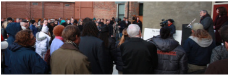
above 2010 Jimmy Heath House Ribbon Cutting