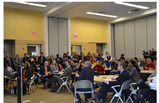
Over 125 people participated in the groundbreaking program