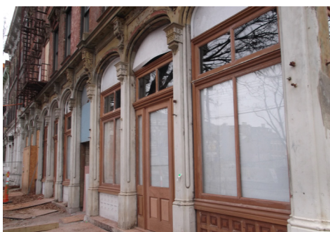
ESSH entrance and north along Elm Street