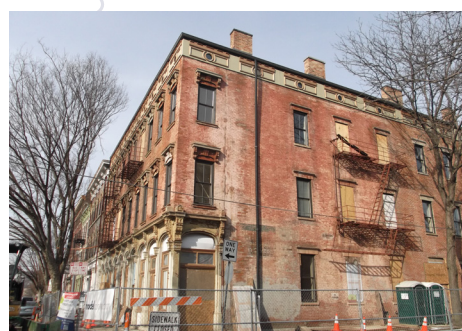
ESSH from 15th Street, March 3