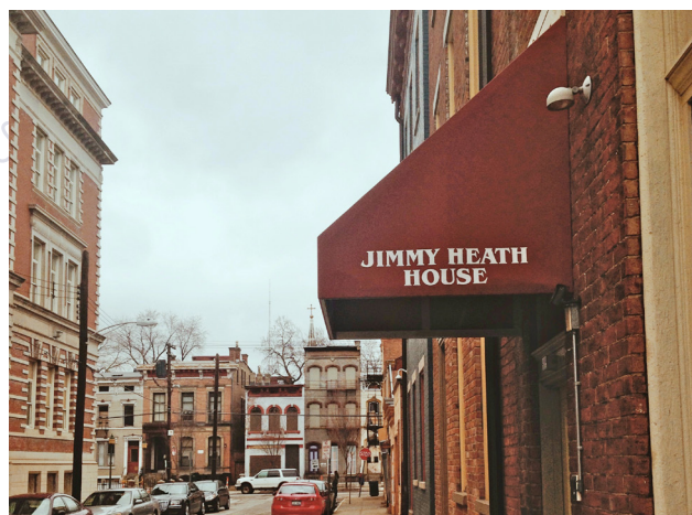
Jimmy Heath House entrance