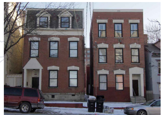
Two of the eight Cutter Apartment buildings

We have partnered with City Studios Architecture, a local architecture firm that specializes in historic renovation. The project is federally subsidized for the next 19 years through the HUD Section 8 program, which means that no resident will pay more than 30 percent of their income for rent. Over-the-Rhine Community Housing is excited to be a part of this project and to continue our mission of developing quality affordable housing!