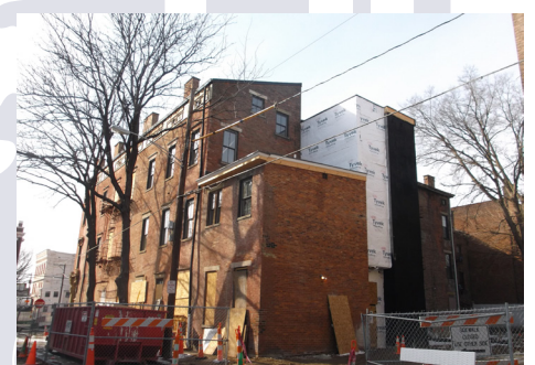
ESSH back and future courtyard, March 3