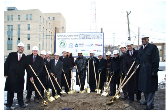
Representatives from all ALI partners at the groundbreaking

Located at the corner of Reading Road and Kinsey Street in Mt. Auburn (across the street from the United Way building) the new Inn will provide 85 units of affordable housing with support services. Construction completion is scheduled for summer 2015. Cincinnati Union Bethel, thanks for including us in your journey. We are truly honored.