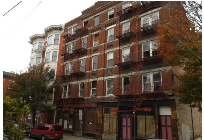
1405-07 Republic Street - Beasley Place

Beasley Place will be an historic rehabilitation of two buildings into 13 affordable units. The project will contain 6 one-bedroom units, 4 two-bedroom units, and 3 three-bedroom units. Apartments range in size from 681 to 1,402 square feet. The project will include a new elevator and common laundry room, as well as approximately 1,200 square feet of first floor commercial space. Once complete, the building will meet enterprise green communities requirements and will have Energy Star appliances and lighting.