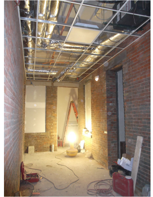
Unfinished interior of an ESSH apartment

The ribbon-cutting and public opening of Elm Street Senior Housing will be held in May. The building will be open at this event for public tours. We hope you will all come and celebrate this wonderful project with us! Watch for more information regarding the date and time for this event.