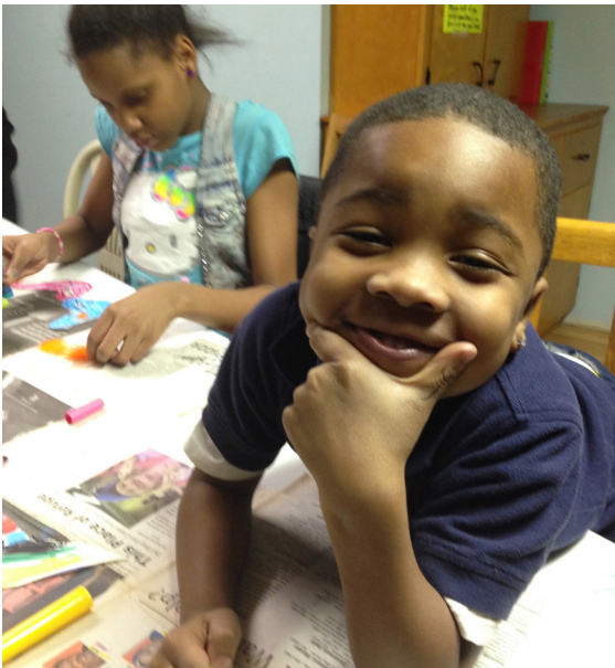
Characters with charisma at CCC

Children's Creative Corner stands poised for Spring. Winter has been a blast, but CCC is looking to turn up the heat on 2014! This year marks CCC's seventh, and with exciting new projects and re-invigorated investment, the months ahead on East Clifton are looking bright.