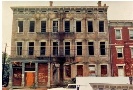
145-147 Mulberry Before

To help answer that question, OTRCH is working with the Over-the-Rhine Community Council and the Community