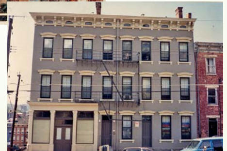
145-147 Mulberry After

Building Institute of Xavier University to conduct an Over-the-Rhine Housing Inventory Study. Funders of the study are OTRCC, 3CDC, PNC Bank, Greater Cincinnati Foundation, and Ohio Capital Corporation for Housing. Results of the study should be available in 2016.