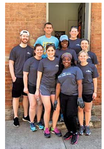
Fifth Third Bank’s Audit Division helped move a low-income elderly tenant into her new apartment at OTRCH.